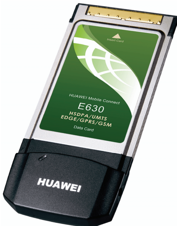
Figure 1-1 E630 Data Card

Figure 1-1 shows the profile of E630 Data Card.