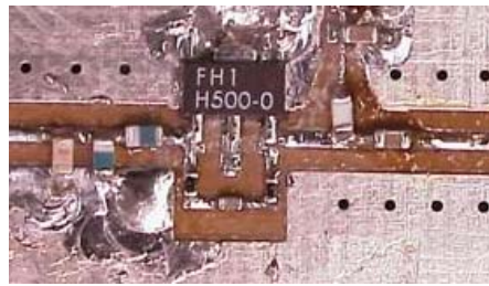
Circuit Board Material: .014” Getek ML200DSS ( \epsilon_r = 4.2 ), 1 oz copper. The main microstrip line has a line impedance of 50 \Omega .